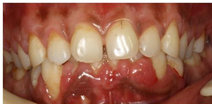
Pre-Operative View (Frontal) At Baseline