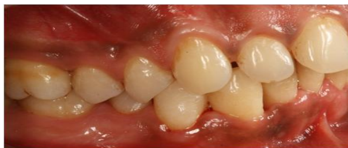
Post-Operative View (Lateral) At 6 Months