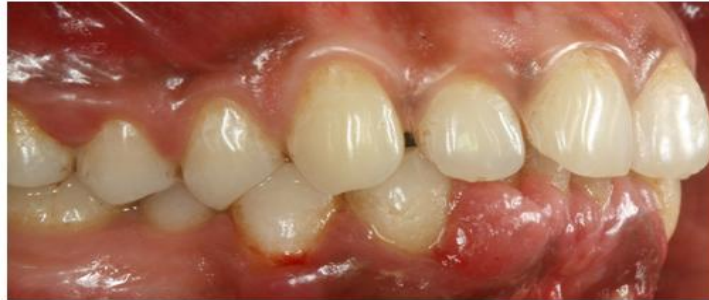
Pre-Operative View (Lateral) At Baseline