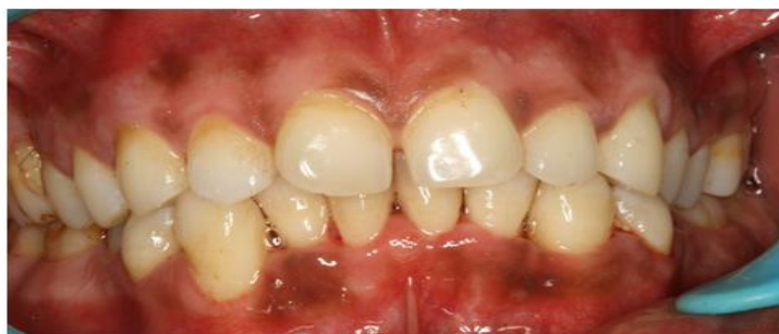
Post-Operative View (Frontal) At 6 Months