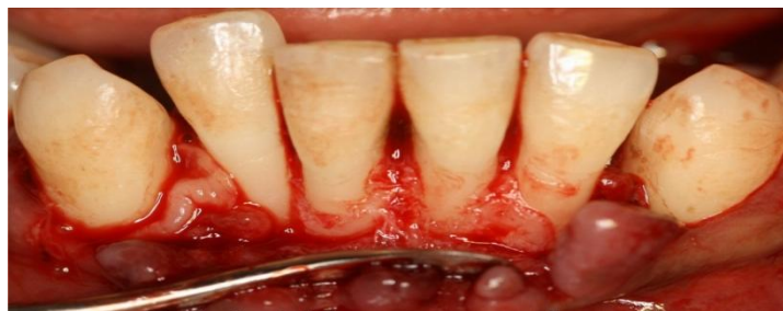
Periodontal Flap Surgery Performed